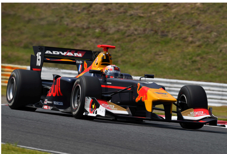
No. 15 Pierre Gasly (TEAM MUGEN) is second in the driver standings after two straight wins in his first SUPER FORMULA season

To retain any chance of winning the championship in the final round, all the top drivers will need to secure points in Round 6. Sportsland SUGO is again set to host a very competitive race this year.