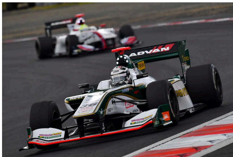
No. 36 Andre Lotterer (VANTELIN TEAM TOM'S) currently sits at the top of the driver standings

Can the leading group keep up their momentum and will the rookie drivers move up the standings? These are just some of the questions for Round 3 as we approach the midpoint of the competition.